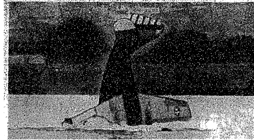
MOMENT OF IMPACT —Private Jacob Cherlin snapped plane above as it hit the submerged object